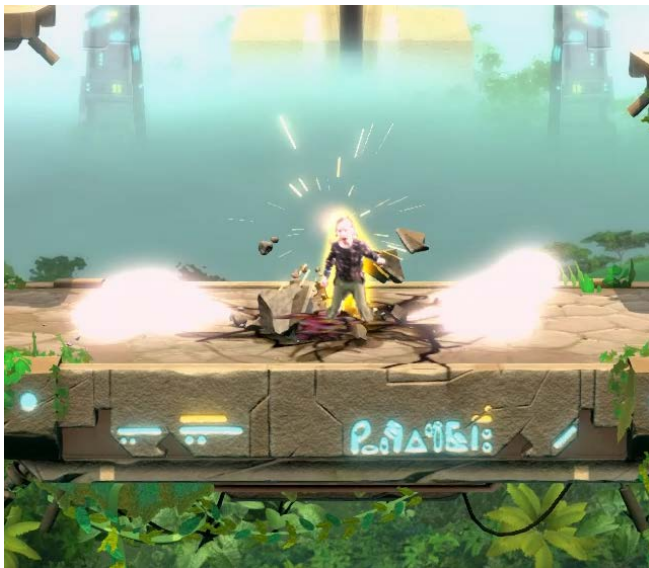
Figure 4. Air particle effects, a camera shake effect, ground shaking and shattering effects, strong sound effects, a wave of light, and flattening the opponent emphasize the superhuman experience in Super Stomp.

Because our measures were based on self-determination theory, of which autonomy is a key component, we did not randomize or allocate (and therefore, force) participants to play Super Stomp for a specific duration of time. Instead, participants were recruited from the park after they finished playing Super Stomp. If the player agreed to participate, parental consent and child assent were obtained if the participant was under 15 years old. Consent was obtained directly from the