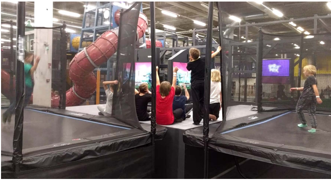
Figure 5. Spectators are seated around the two displays watching people play Super Stomp. Spectators were often cheering and interacting with the players.

Competence refers to being presented with and mastering challenging tasks. Games have tremendous potential to offer competence through such means as solving complex puzzles and completing difficult game missions. Movement empowerment has also been shown to support competence [13, 17]. As shown in Table 1, however, competence was the lowest rated of three components of SDT measured by the UPEQ questionnaire, though it was still generally rated quite highly. The lower rating could be due to the low mean playtime reported by players, which was M = 8.58 min ( SD = 9.20 min). Jumping on a trampoline can quickly become exhausting, which could have contributed to the low mean playtime. This explanation can be coupled with the fact that only 3 participants had played this game before the study was conducted. Playing a game you have never played before for around 8.5 min certainly may have contributed to the lower competence score in comparison with the other components.