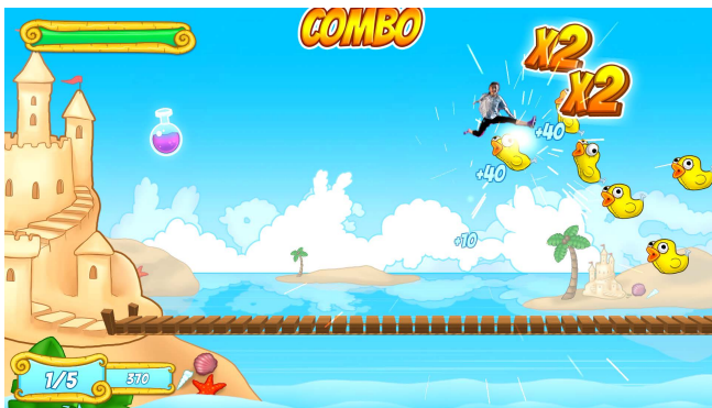
Figure 3. In Toywatch, a player protects a base by jumping at waves of inflatable toy enemies.

In early experiments with Super Stomp, it was found that any kind of punching and kicking is not meaningful; due to latency, it was impossible to dodge or block, and combat regressed to random flailing. Thus, we were constrained from using direct interactions between players that are dependent on real-time poses. We overcame this constraint by implementing player