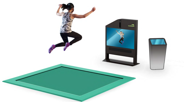
Figure 2. The ValoJump mixed-reality trampoline game platform consists of a display screen, a trampoline, a camera, proprietary motion tracking software, and a touchscreen display used for administrative purposes.

limit wins the game (see Figure 1). Super Stomp was developed using the Unity game engine [35, 38] through an iterative design process. It was the first multiplayer game developed for the ValoJump mixed-reality trampoline game platform, which consists of a display screen, a trampoline, a camera, proprietary motion tracking software, and a touchscreen display for administrative purposes (see Figure 2). A number of single-player games were developed for the ValoJump platform first, exploring the unique design space of trampoline interactions.