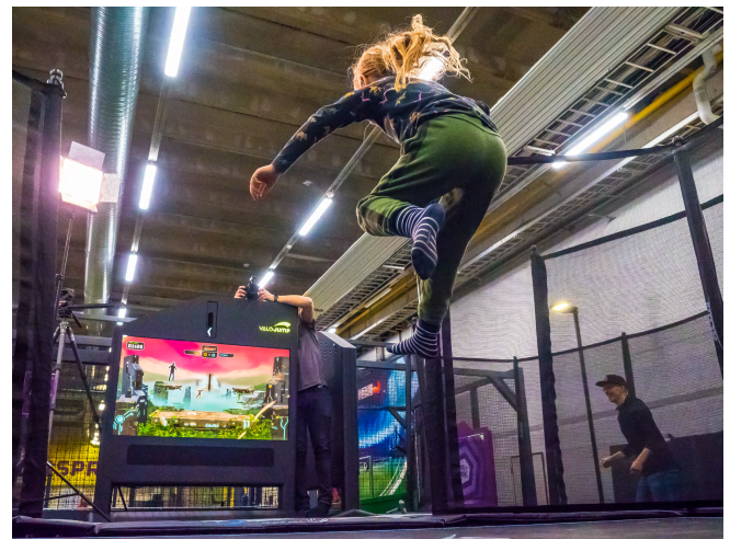
Figure 6. Players can stomp using any pose they desire.

Complementing prior work, we provide additional evidence that movement empowerment may support autonomy, competence, and relatedness. Supporting innate human needs might provide an incentive to exercise, which is important given that lack of exercise is a major public health problem. Super Stomp empowers movement primarily through exaggerated jump height. Through our study, we learned that a majority of participants noticed the exaggeration, and they found that it enhances their experience with the game. But, we have merely